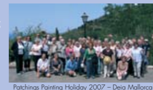
Patchings Painting Holiday 2007 – Deira Mallorca